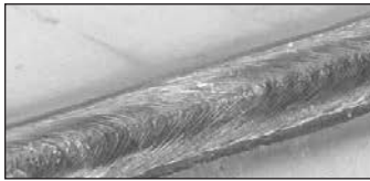
Power Mode® reduces spatter and improves bead appearance, even for low voltage procedures on stainless.