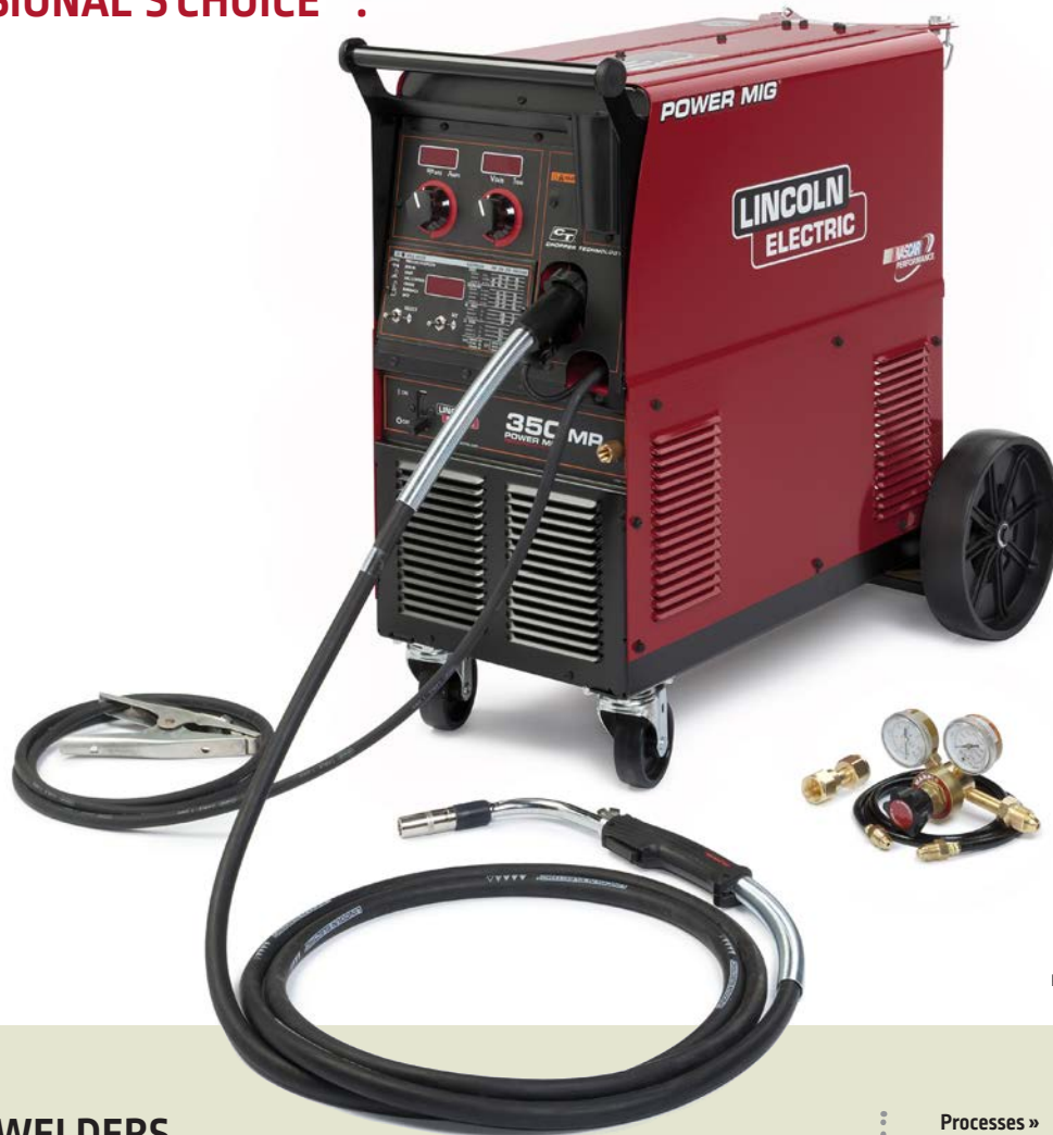
Shown: POWER MIG® 350 MP, K2403-1