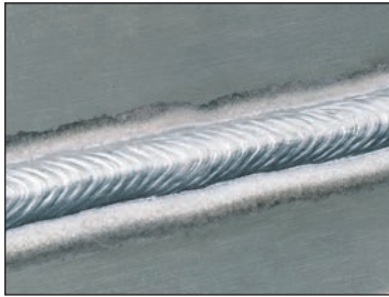
Pulse-On-Pulse® on 3 mm Aluminum

Pulse-On-Pulse® uses a sequence of varying pulse wave shapes to produce a TIG-like bead appearance and excellent weld properties when MIG welding aluminum. Pulse-On-Pulse® controls arc length and heat input together, making it easier to achieve good penetration. See NX-2.10