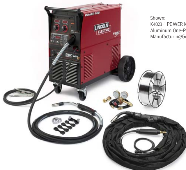
Shown: K4023-1 POWER MIG® 350MP Aluminum One-Pak® for Trailer Manufacturing/General Fab