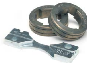
Shown: KP1697-035C, Cored Drive Roll Kit