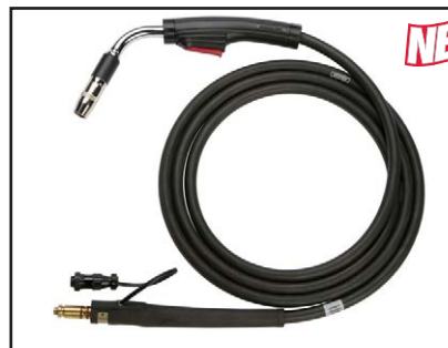
NEW! Magnum® PRO 250L Gun With long lasting Copper Plus™ contact tips