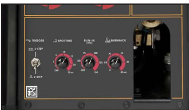
Timer Functions Adds 4-step trigger interlock, spot mode, adjustable run-in speed for smoother arc starting, and adjustable burnback time to minimize wire sticking in puddle.