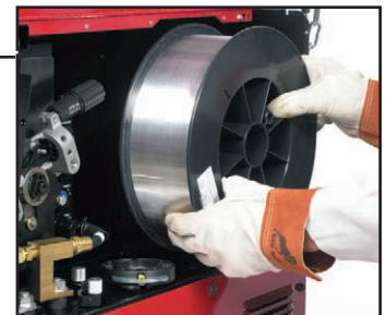
Easy Load Wire Compartment