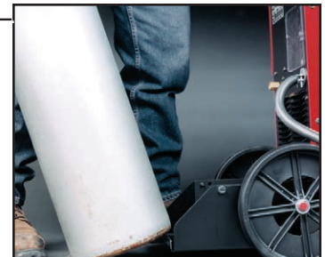
Easy Load Gas Cylinder Platform