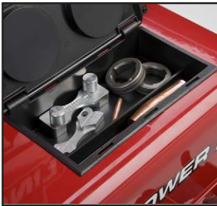
Gun Expendable Parts Compartment