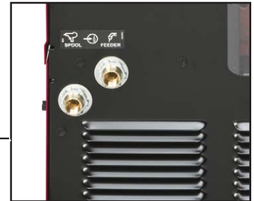
Additional Gas Solenoid – Controls Gas Flow to a Spool Gun