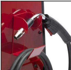
Coil claw Keeps your workstation organized