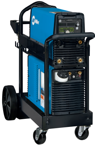
907538002 Maxstar 280 TIGRunner® shown with four bottles of 043810 Low-Conductivity Coolant.

Select desired stock number for each step.