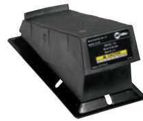
194744 remote shown.