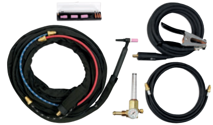
300990 kit shown.