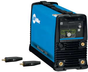
907552 Maxstar shown.

Select desired stock number for each step.