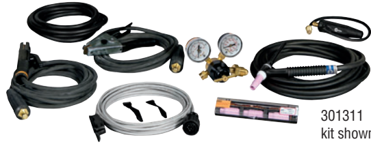
301311 kit shown.