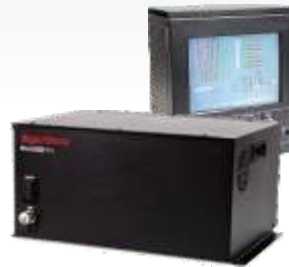
MicroEDGE Pro CNC controller