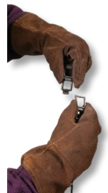
Adjusting Chain Links for Various Diameters