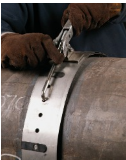
Clamping Guide Rail Overlap

The guide rail provides high cutting accuracy and makes the Auto Pickle P -S Type plasma pipe cutting machine particularly suitable for large pipes. Countless professionals including fabricators, scrap yards, boiler makers and tank manufacturers are using Koike pipe cutting machine products successfully.