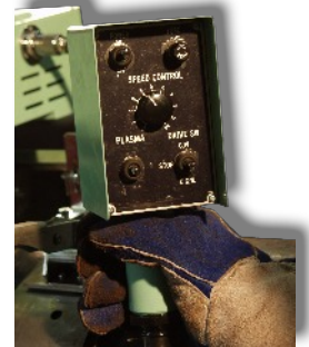
Remote Control Pendant allows safe control away from cutting workpiece

The Auto Pickle P -S Type allows accurate bevel and straight cuts in the shop or out in the field.