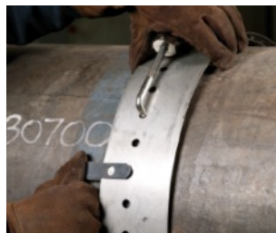
Adjusting for Guide Rail Overlap