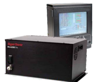
● MicroEDGE Pro CNC controller