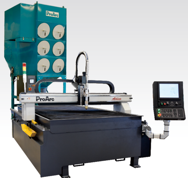
● ProArc Total Cutting Solution