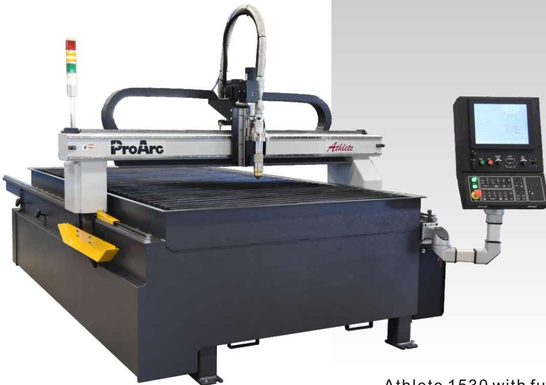
● Athlete 1530 with fume collection table

Athlete is the high speed, high precision CNC cutting machine which can integrate with HyDefinition plasma cutting system to perform the best cutting quality.